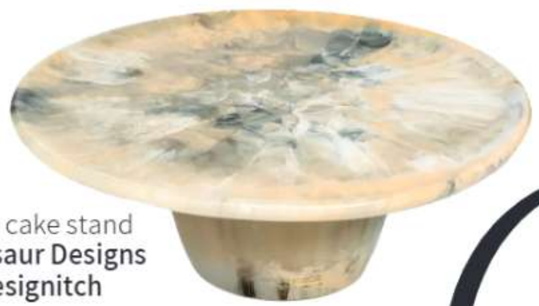
Temple cake stand by Dinosaur Designs at Designitch