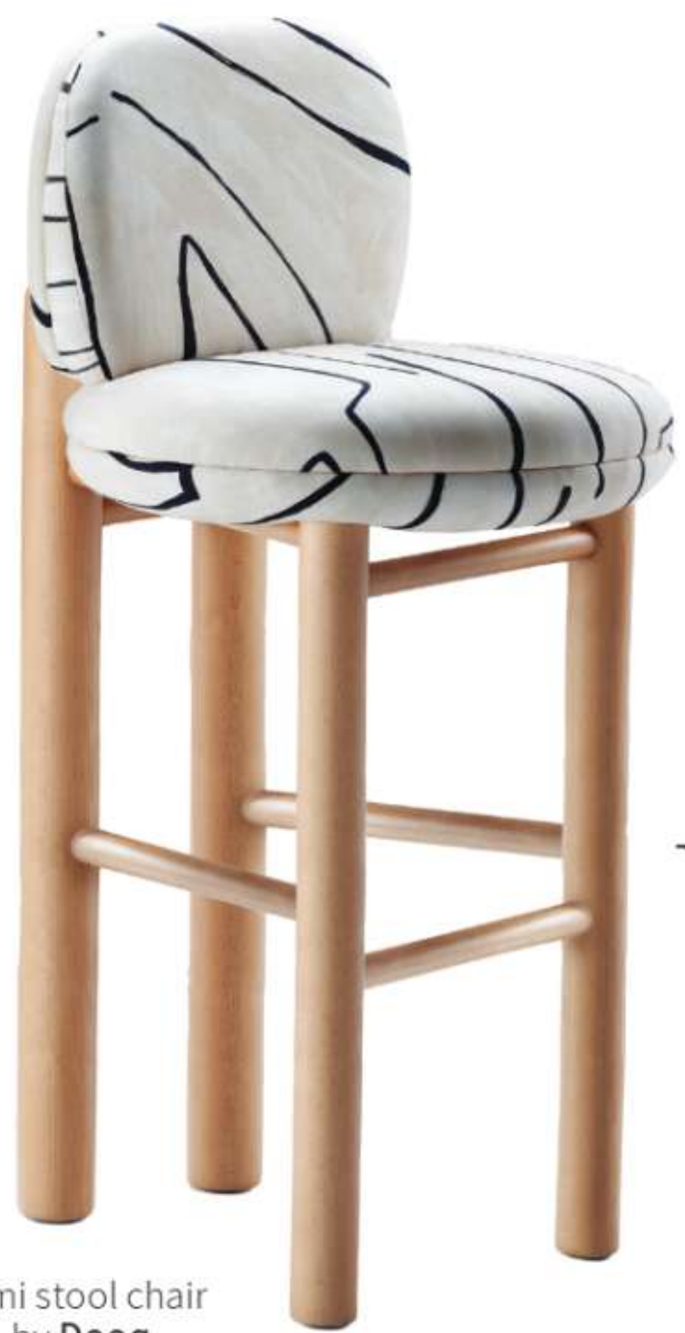
Aimi stool chair by Dooq at Designitch