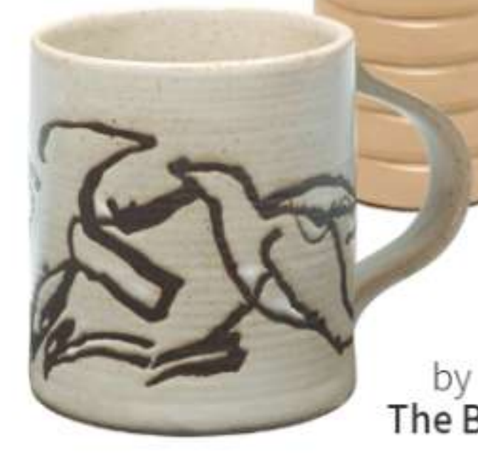
Vuelo mug by Ferm Living at The Bowery Company