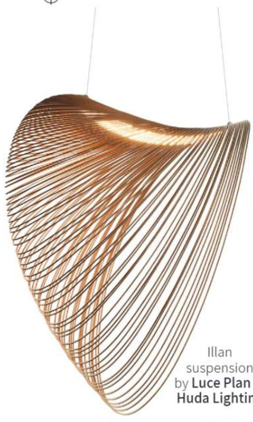
Illan suspension by Luce Plan at Huda Lighting