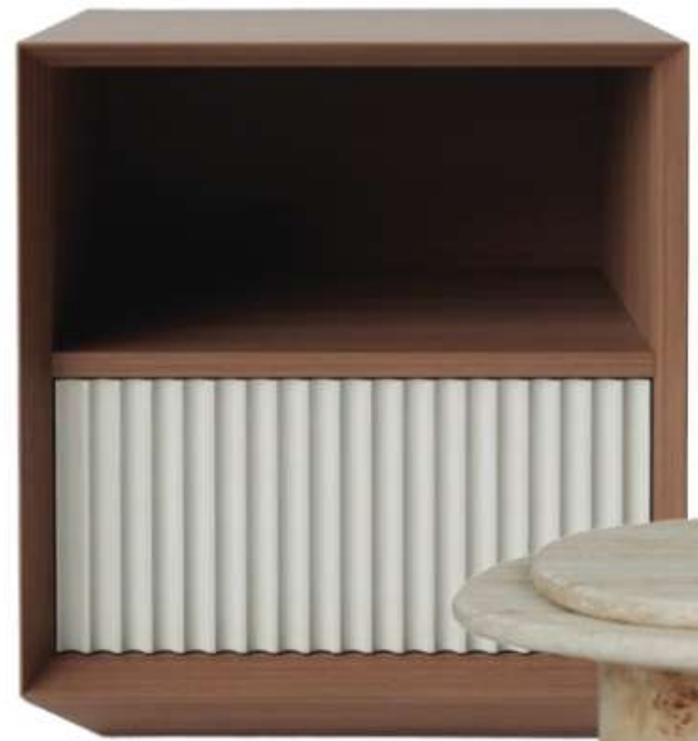
Pillar bedside table at The Conran Shop