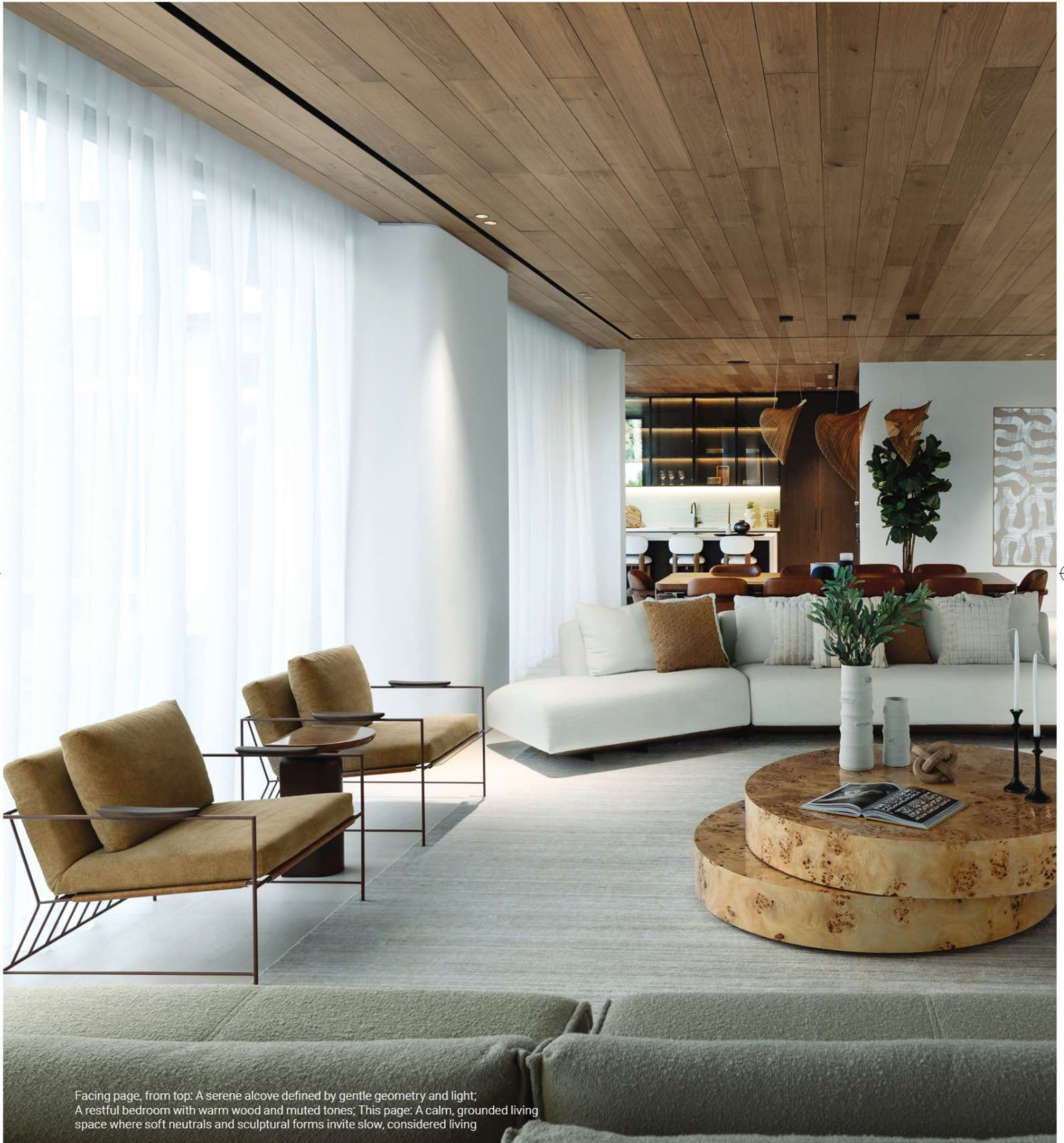
Facing page, from top: A serene alcove defined by gentle geometry and light; A restful bedroom with warm wood and muted tones; This page: A calm, grounded living space where soft neutrals and sculptural forms invite slow, considered living