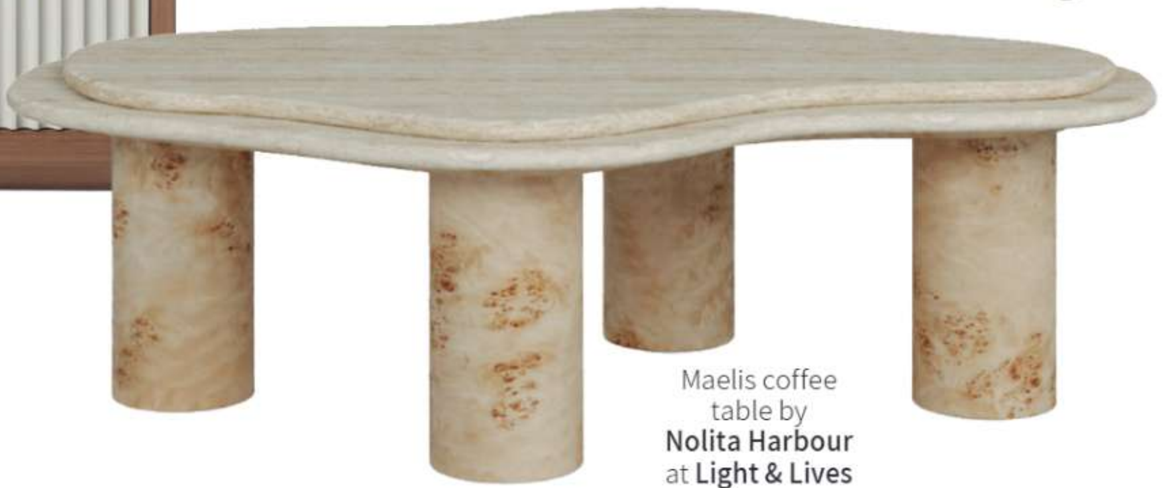
Maelis coffee table by Nolita Harbour at Light & Lives