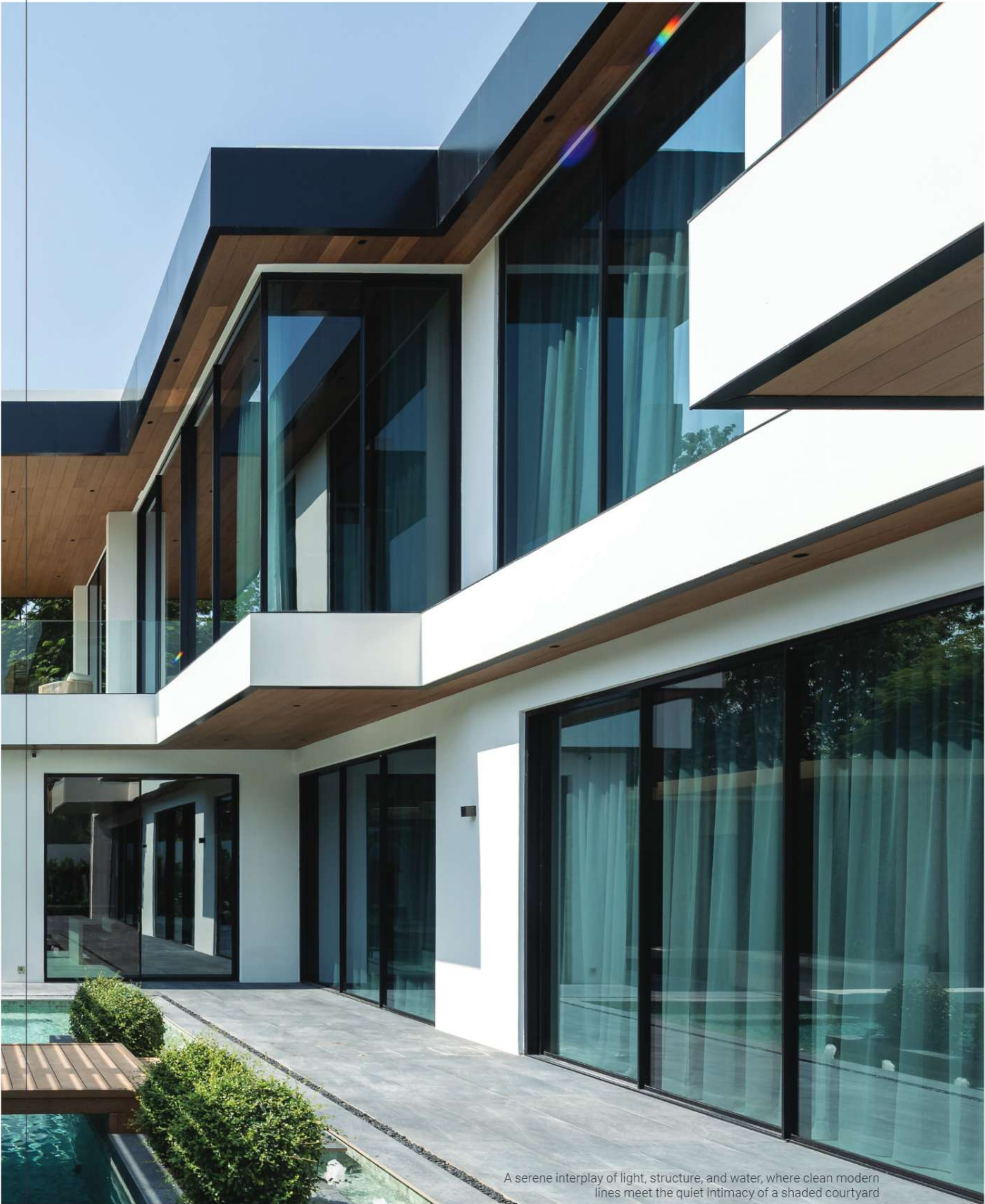
A serene interplay of light, structure, and water, where clean modern lines meet the quiet intimacy of a shaded courtyard