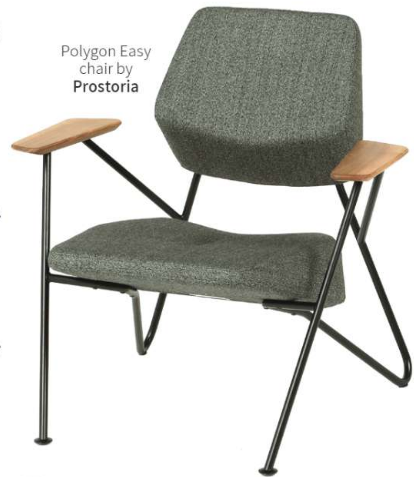
Polygon Easy chair by Prostoria