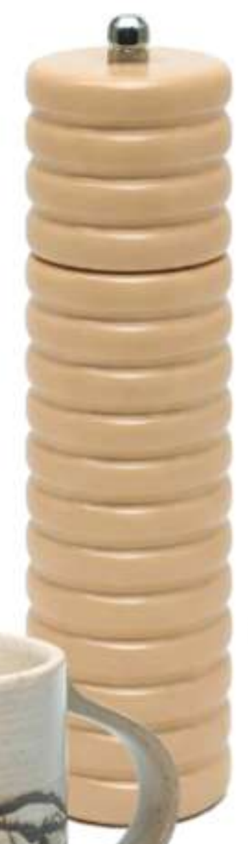
Salt and pepper mill by Bazar De Luxe at Birds n Bees